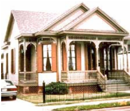
Decorative features were painted with a traditional oil-based paint as a part of the rehabilitation.

Based on the assumption that the exterior wood has been painted with oil paint many times in the past and the existing top coat is therefore also an oil paint, it is recommended that for CLASS I and CLASS II paint surface conditions, a top coat of high quality oil paint be applied when repainting. The reason for recommending oil rather than latex paints is that a coat of latex paint applied directly over old oil paint is more apt to fail. The considerations are twofold. First, because oil paints continue to harden with age, the old surface is sensitive to the added stress of shrinkage which occurs as a new coat of paint dries. Oil paints shrink less upon drying than latex paints and thus do not have as great a tendency to pull the old paint loose.