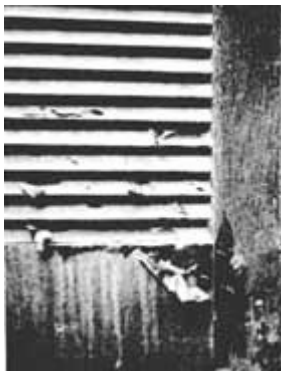
Here, a latex top coat was applied directly over old oil paint, resulting in intercoat peeling. The latex was unable to adhere. If latex is used over oil, an oil-base primer should be applied first.