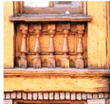
When the protective and decorative paint finish was removed and an inappropriate clear finish applied, the exterior character of the building was altered.

When historic buildings are involved, however, a special set of problems arises--varying in complexity depending upon their age, architectural style, historical importance, and physical soundness of the wood--which must be carefully evaluated so that decisions can be made that are sensitive to the longevity of the resource.