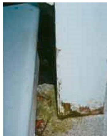
The problem evidenced here by mossy growth and deteriorated wood must be resolved and the wood allowed to dry out before the wood is repainted.

Paint surface conditions can be grouped according to their relative severity: CLASS I conditions include minor blemishes or dirt collection and generally require no paint removal; CLASS II conditions include failure of the top layer or layers of paint and generally require limited paint removal; and CLASS III conditions include substantial or multiple-layer failure and generally require total paint removal. It is precisely because conditions will vary at different points on the building that a careful inspection is critical. Each item of painted exterior woodwork (i.e., siding, doors, windows, eaves, shutters, and decorative elements) should be examined early in the planning phase and surface conditions noted.