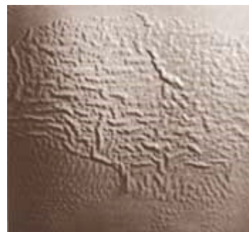
Wrinkled layers can generally be removed by scraping and sanding as opposed to total paint removal.

Another error in application that can easily be avoided is wrinkling. This occurs when the top layer of paint dries before the layer underneath. The top layer of paint actually moves as the paint underneath (a primer, for example) is drying. Specific causes of wrinkling include: (1) applying paint too thick; (2) applying a second coat before the first one dries; (3) inadequate brushing out; and (4) painting in temperatures higher than recommended by the manufacturer.