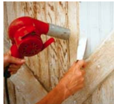
The nozzle on the electric heat gun permits hot air to be aimed into cavities on solid decorative surfaces, such as this carriage house door. After the paint has been sufficiently softened, it can be carefully removed with a scraper.

Electric heat gun: The electric heat gun (electric hot-air gun) looks like a hand-held hairdryer with a heavy-duty metal case. It has an electrical resistance coil that typically heats between 500 and 750 degrees Fahrenheit and, again, uses about 15 amps of power which requires a heavy-duty extension cord. There are some heat guns that operate at higher temperatures but they should not be purchased for removing old paint because of the danger of lead paint vapors. The temperature is controlled by a vent on the side of the heat gun. When the vent is closed, the heat increases. A fan forces a stream of hot air against the painted woodwork, causing a blister to form. At that point, the softened paint can be peeled back with a putty knife. It can be used to best advantage when a paneled door was originally varnished, then painted a number of times. In this case, the paint will come off quite easily, often leaving an almost pristine varnished surface behind. Like the heat plate, the heat gun works best on a heavy paint buildup. (It is, however, not very successful on only one or two layers of paint or on surfaces that have only been varnished. The varnish simply becomes sticky and the wood scorches.)