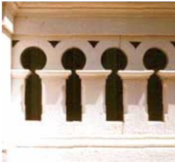
The paint on this exterior decorative feature is sound.

Paint applied to exterior wood must withstand yearly extremes of both temperature and humidity. While never expected to be more than a temporary physical shield--requiring reapplication every 5 to 8 years--its importance should not be minimized. Because one of the main causes of wood deterioration is moisture penetration, a primary purpose for painting wood is to exclude such moisture, thereby slowing deterioration not only of a building's exterior siding and decorative features but, ultimately, its underlying structural members. Another important purpose for painting wood is, of course, to define and accent architectural features and to improve appearance.